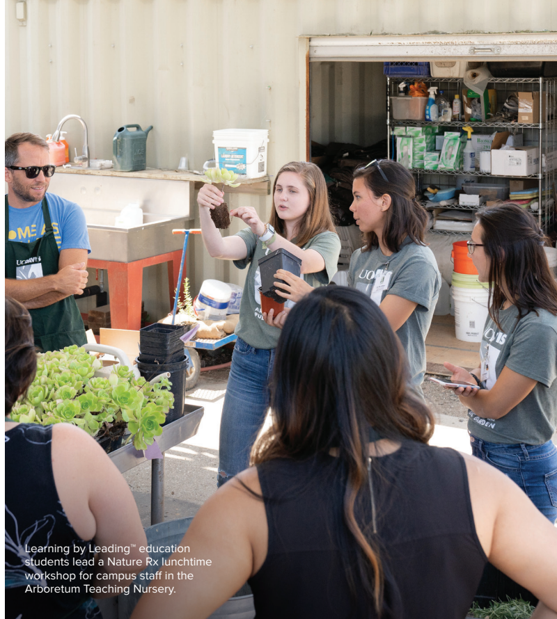
"Learning by Leading" education students lead a Nature Rx lunchtime workshop for campus staff in the Arboretum Teaching Nursery.