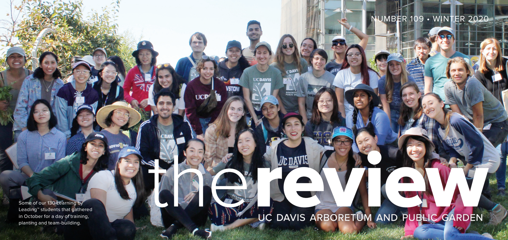
Some of our 130 Learning by Leading™ students that gathered in October for a day of training, planting and team-building.